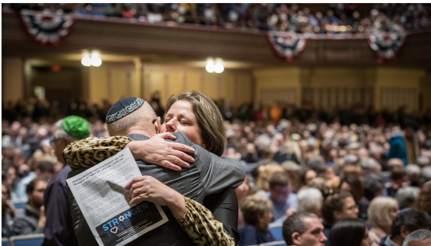
An interfaith vigil for the victims of the Tree of Life shooting took place at Soldiers and Sailors Memorial Hall and Museum on Sunday, Oct. 28, 2018.

5 p.m. Nov. 13 (Squirrel Hill): Enjoy food trucks ( https://www.facebook.com/events/283401368951830/ ) with proceeds benefitting Tree of Life.