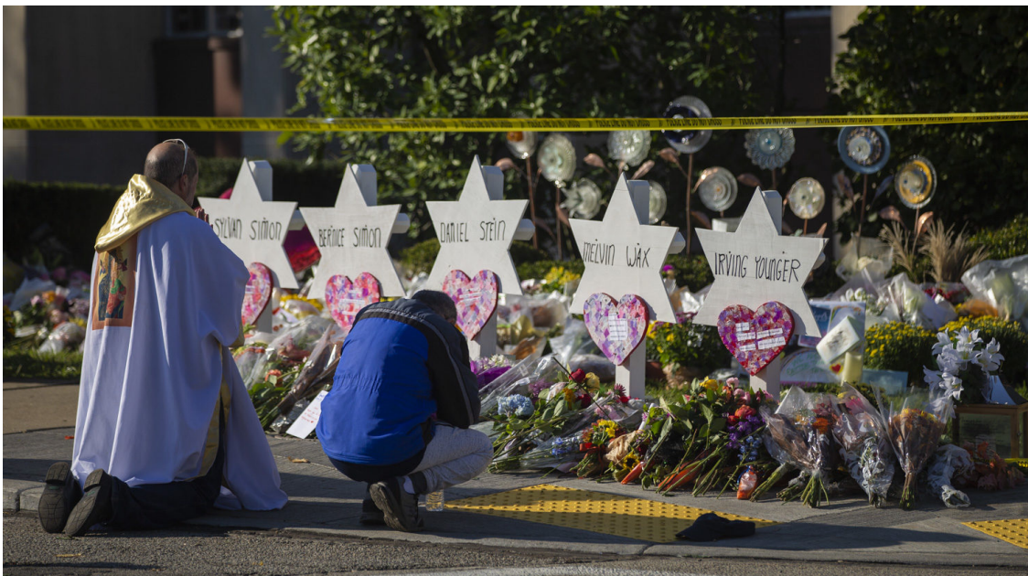
A tribute to shooting victims along Shady Avenue on Tuesday, Oct. 30, 2018

We'll continue to update this list, so please email us (mailto:tips@theincline.com) with additions.