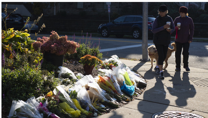
Pedestrians make their way past a collection of flowers placed for victims of the synagogue shooting along Shady Avenue in Pittsburgh, Pennsylvania on Tuesday, Oct. 30, 2018.

7 p.m. Nov. 27: The Pittsburgh Symphony Orchestra concert benefitting Tree of Life is sold-out, but you can listen to “Tree of Life: The Concert for Peace and Unity” ( https://www.wqed.org/fm ) live on on WQED-FM 89.3.