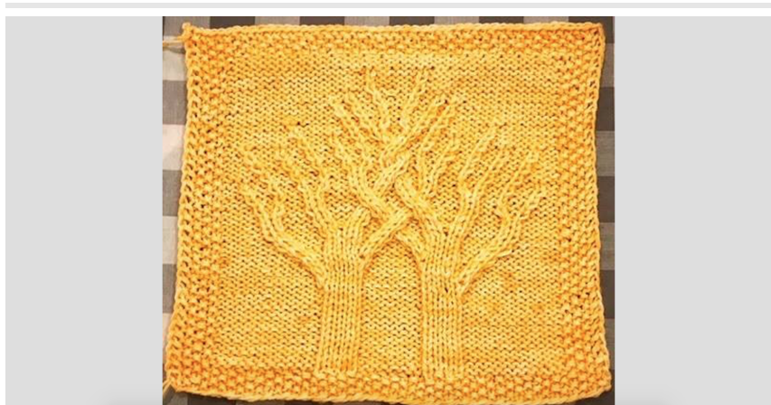
An example of the Tree of Life knit square.

9 a.m. to 2 p.m. Nov. 18 (Squirrel Hill): Make an appointment ( https://donateblood.centralbloodbank.org/AppointmentScheduling.aspx ) for a blood drive at Shaare Torah Congregation on Murray Avenue.